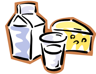
Milk or Dairy Products