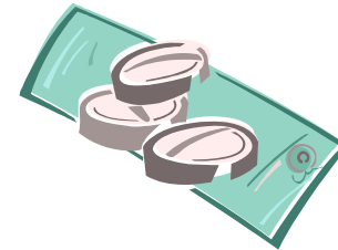
Antacids (for example, Tums®, Rolaids®)